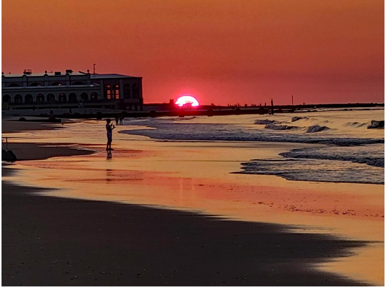
Sunrise over Ocean City, New Jersey - on family vacation trip, July 2023