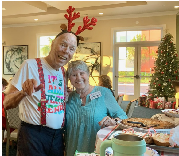
Reindeers Lou Rizk and Cheryle Phelps