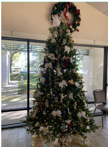
Gorgeous Angel Tree