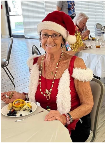
Santa Sue looking good!