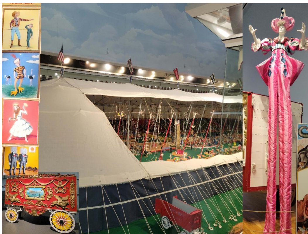
Collage picture of circus treasures