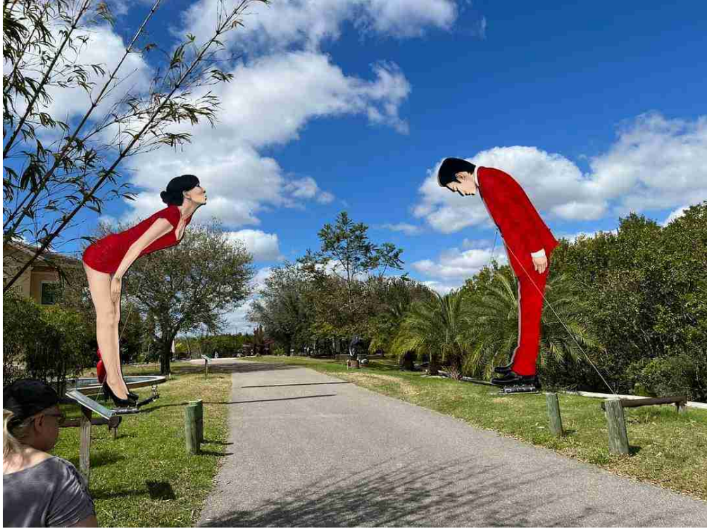
Peace River Gardens and Sculptures