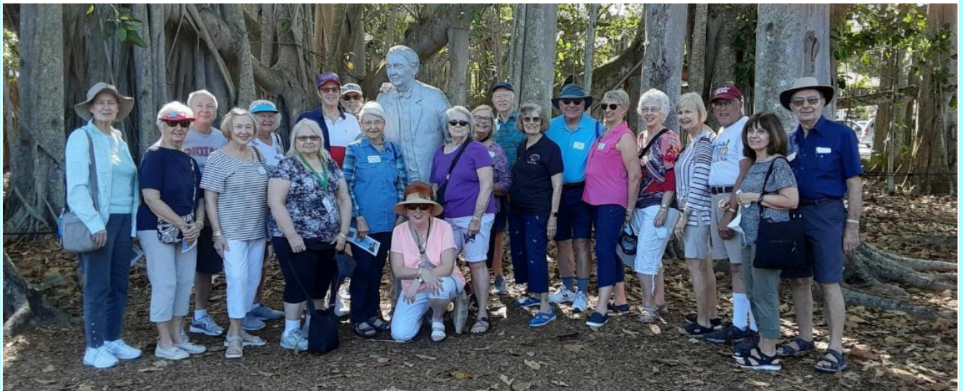
Visiting Edison Ford Estates