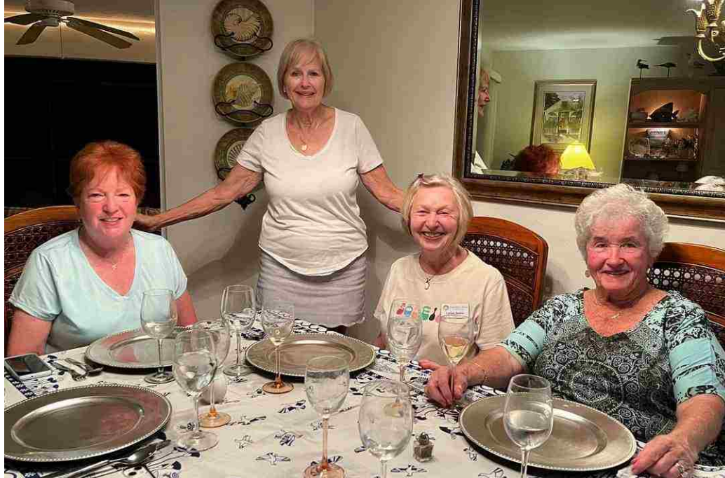
Small dinner party fun