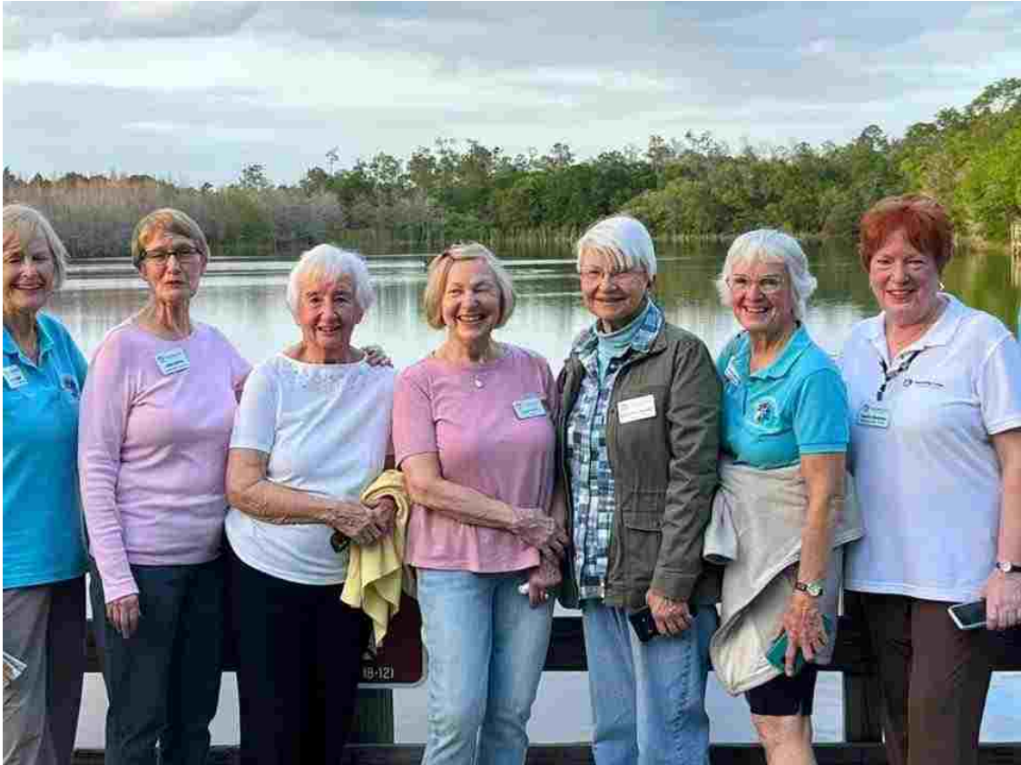
Welcome Party at Six Mile Cypress