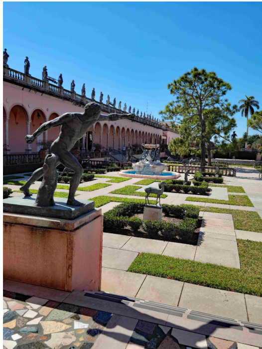
Fabulous courtyard garden outside of museum