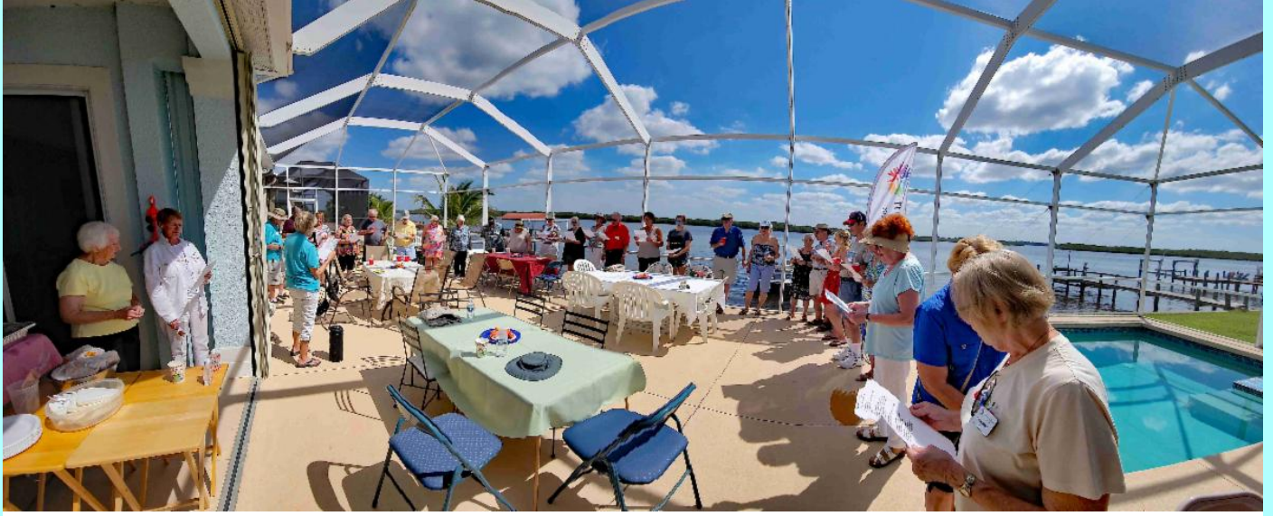
Fabulous Farewell Party - saying our Pledge and singing Let There Be Peace on Earth